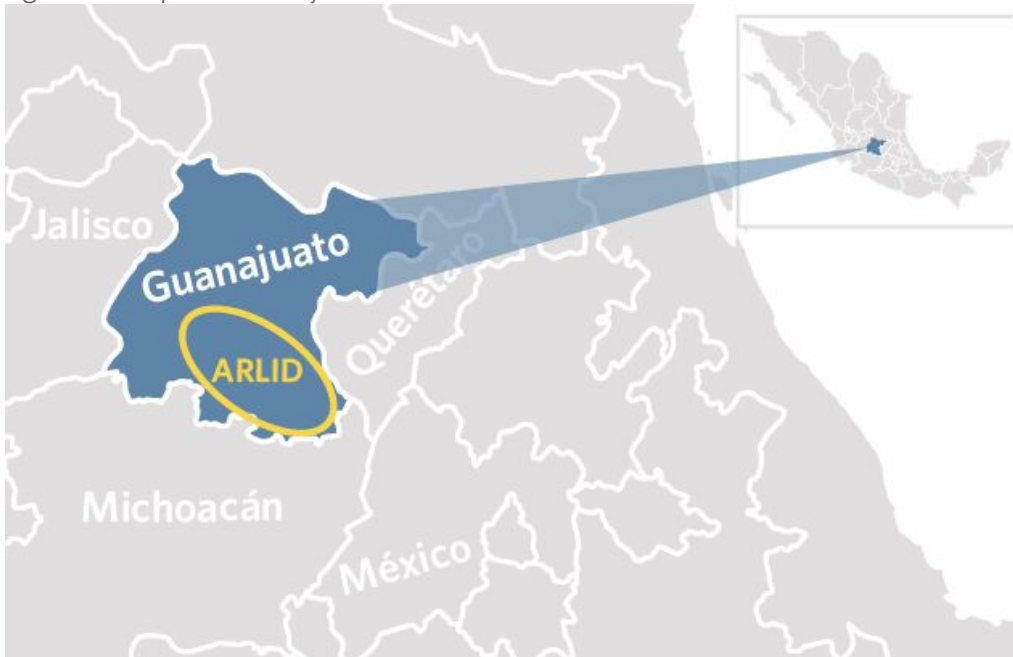
Figure 2. Map of Guanajuato

The pilot project is centered around grains production in the Alto Rio Lerma Irrigation District (ARLID), due to the interest of FEMSA Foundation, which sources grains from the region. Climate change severely threatens grains yields in the region, and for example barley yields losses are estimated from 3% to 17% (Beverage Daily, 2018).