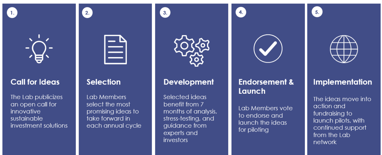
Figure 2: An Overview of the Lab Process

A complete Lab Cycle operates over the course of a 12-month period (see Figure 2). Lab Members are convened throughout the cycle to fine-tune as well as challenge the selected ideas. The Lab's Sixth Cycle will run from September 2019 to September 2020, with the majority of the analytical work concluding in July 2020. This 12-month cycle includes three distinct analytical phases, concluded with endorsement: Phase 1 (Call for Ideas and Selection); Phase 2 (Instrument Design); Phase 3 (Implementation Pathway and Impact).